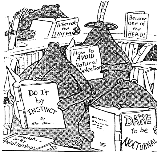
In the animal self-help section